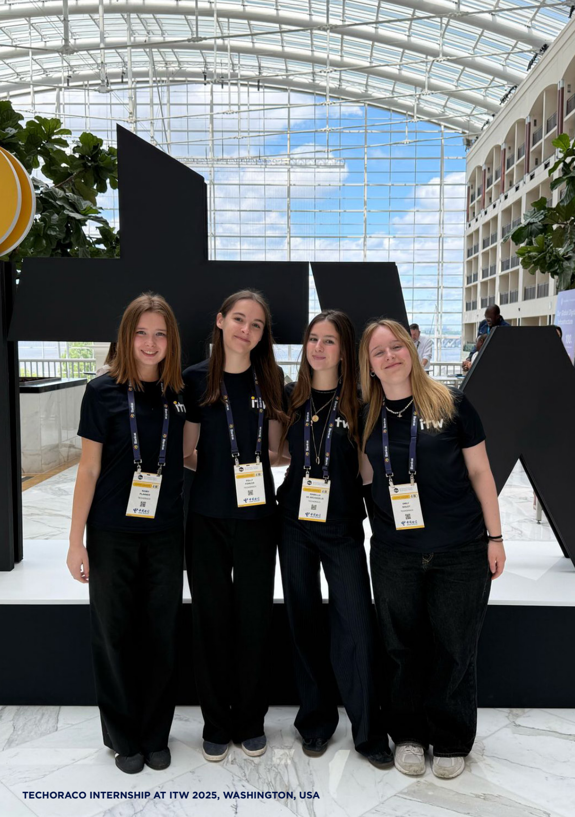
TECHORACO INTERNSHIP AT ITW 2025, WASHINGTON, USA